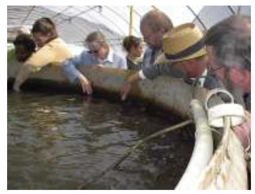
OAFES Fall Meeting attendees toured research areas at The Ohio State University South Centers.

OSU South Centers, spoke about the "Risks Versus the Benefits of Eating Seafood," including the Harvard study. In